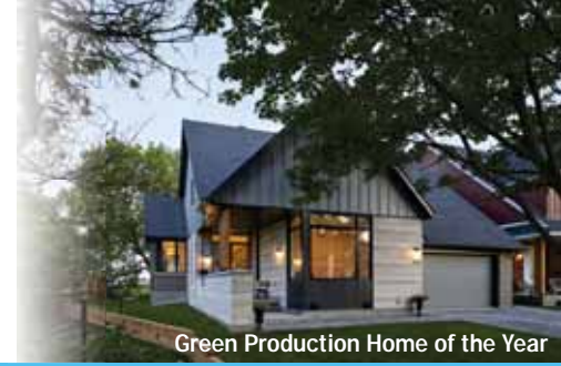
Green Production Home of the Year

RND is proud to be the recipient of 3 GOHBA awards, including Green Custom Home of the Year for the 9th consecutive year. We also won for Green Production Home of the Year.