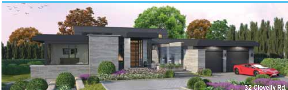
32 Clovelly Rd.