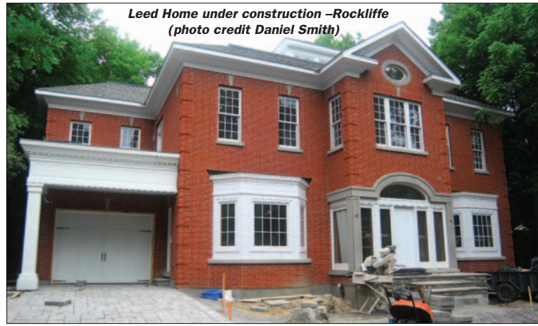
Leed Home under construction –Rockcliffe

PHOTO CREDIT: CHRISTOPHER SIMMONDS ARCHITECT INC.