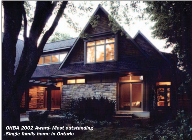
OHBA 2002 Award- Most outstanding Single family home in Ontario