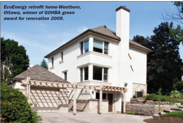
EcoEnergy retrofit home-Westboro, Ottawa, winner of GOHBA green award for renovation 2009.