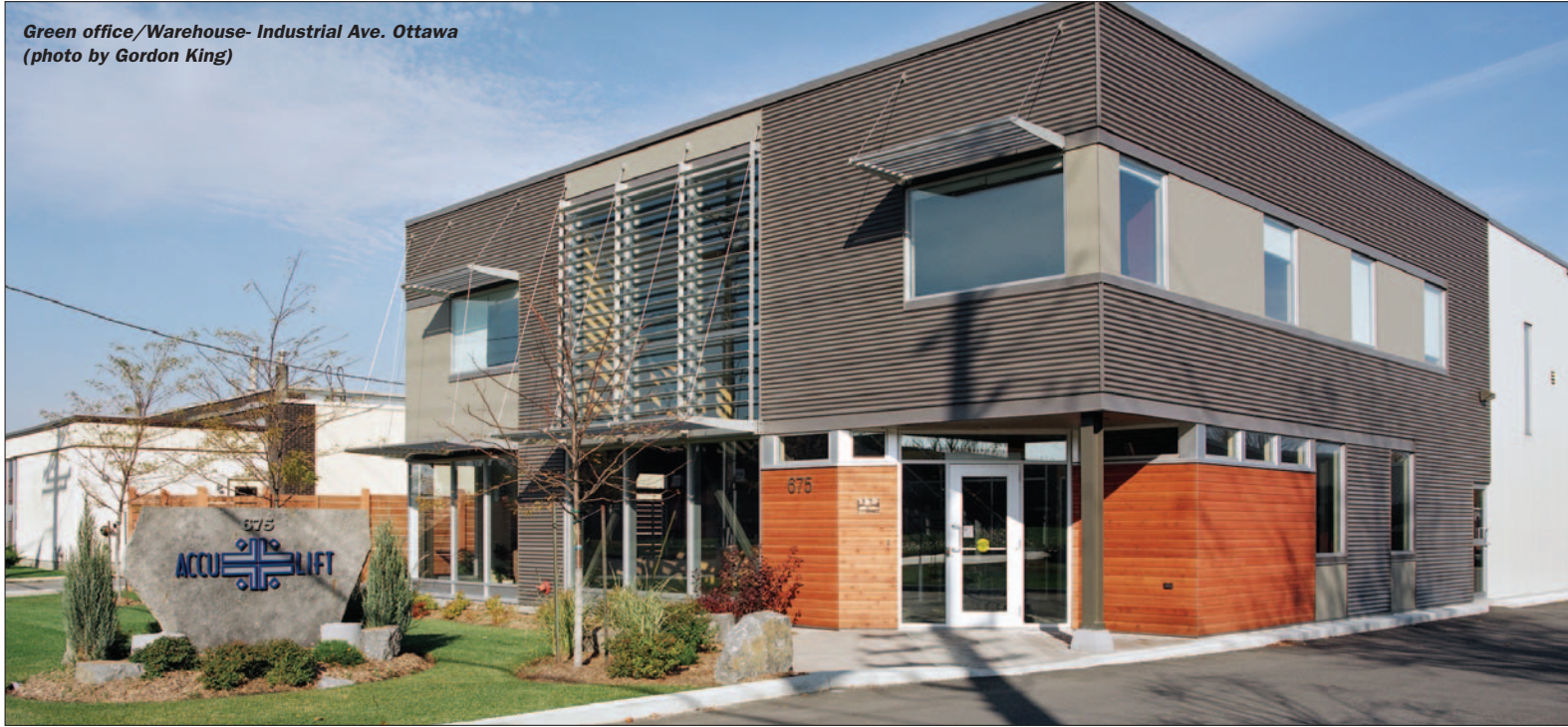
Green office/Warehouse- Industrial Ave. Ottawa

STAFF WRITER – The Ottawa Construction News Special Feature