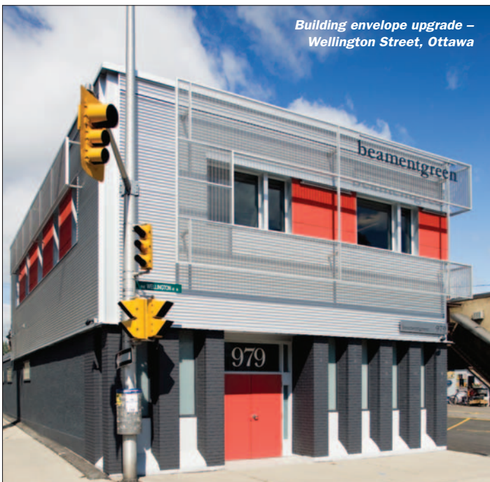
Building envelope upgrade – Wellington Street, Ottawa

PHOTO CREDIT: CHRISTOPHER SIMMONDS ARCHITECT INC.